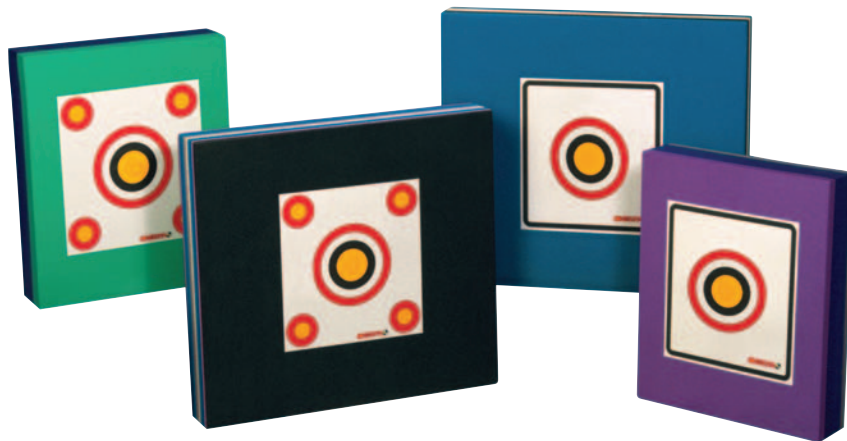
Compact Arrowsnuffer foam targets from Delta Industries.