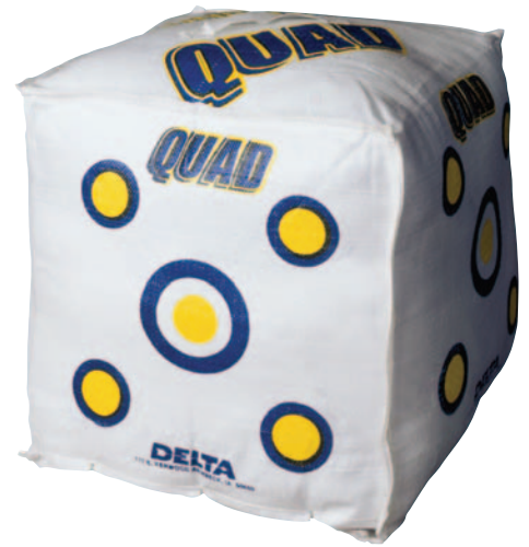
The wide line of field point targets from Delta Industries includes the Burly (left), available in two sizes, and the freestanding Quad. Reach the Iowa firm at (800) 708-0673.

three bag targets: the Super Stop, Magnum Super Stop and Infinity. The Super Stop and Magnum Super Stop both feature a foam target face and layered construction for arrow stopping power. The Infinity is an 18-inch thick foam covered, cloth-centered field point target that will stop all types of arrows from all types