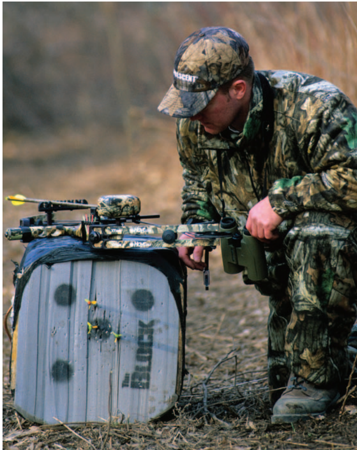
The Block comes in a number of sizes from super portable targets that you can keep in the trunk of your car, up to targets that work best as backstops at archery club ranges.

Delta: The Tru-Life paper animal targets have probably been shot at by more bowhunters than any other target made. They are standard issue at most ranges and are a fun alternative to shooting at spots. Each has lightly marked scoring lines for those who want to use them for competition. I once shot an indoor winter league in Michigan and these targets were all we shot. It was a blast.